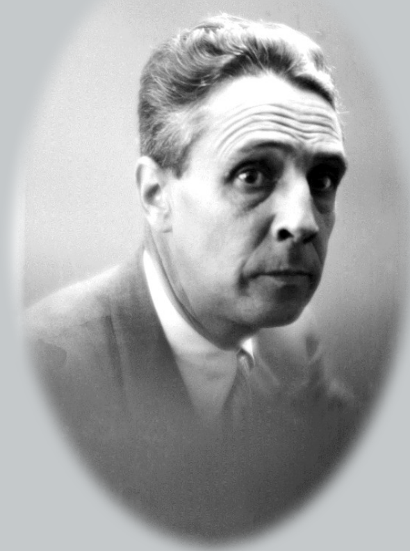
DORDIO GOMES (1890 -1976)